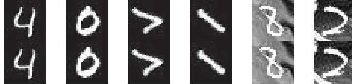
Figure 3: The original (the top row) and successfully perturbed (the bottom row) images.

compares performance of the algorithms for \epsilon = 1 using cactus plots. Cactus plots for other values of \epsilon are similar.